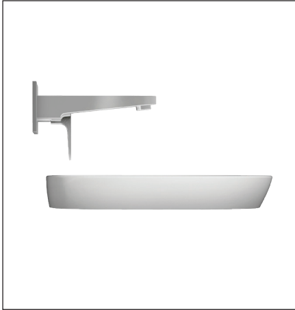
Tapware shown is not included.

Simplicity is the new luxury. Caroma's Contura collection comprises of soft and organic shapes that enable a feeling of space. This basin is suitable for general purpose, domestic and commercial applications.