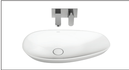
White colour version

Dimensions: All dimensions are in millimetres and are subject to normal manufacturing variations. Caroma pursues a policy of continuing improvement in design and performance of its products. The right is therefore reserved to vary specifications without notice.